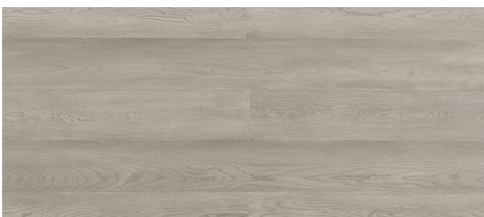
SILVER ASH 007