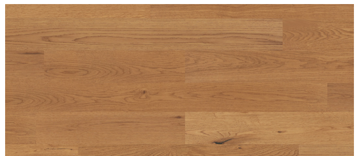
NATURAL OIL 006