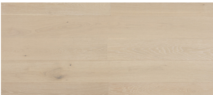
REFINED MAPLE 005