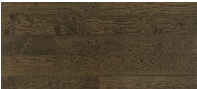
GREY STONE 003