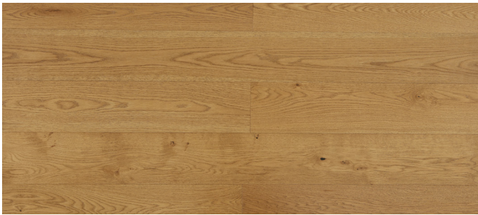
COUNTRY OAK 001