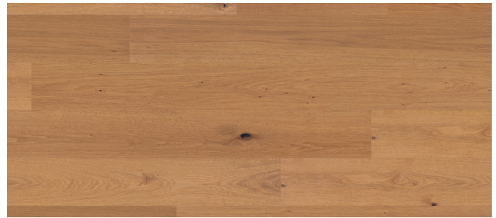
CLASSIC OAK 002